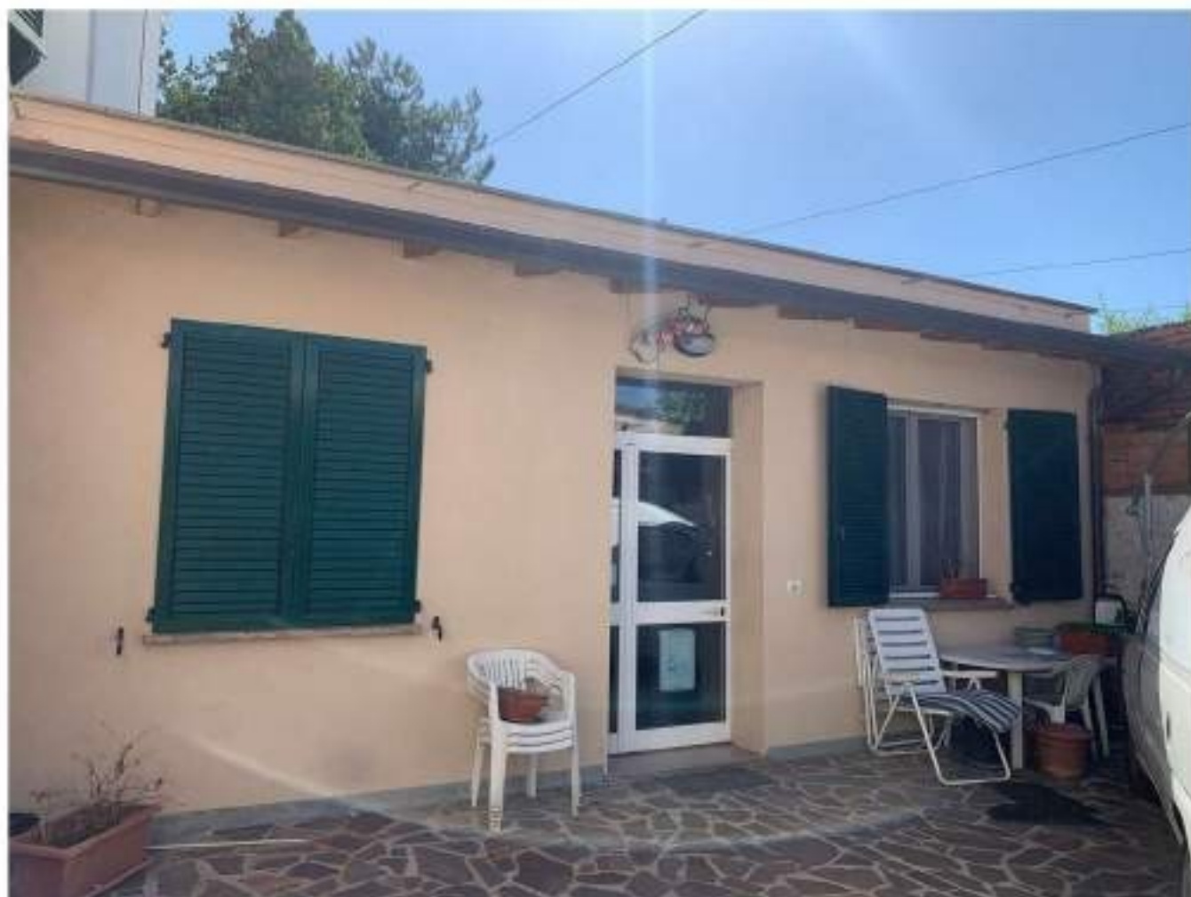
1.2 Accesso fronte