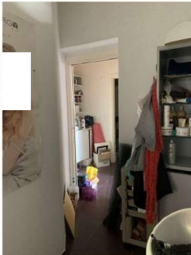
06 Locale 2