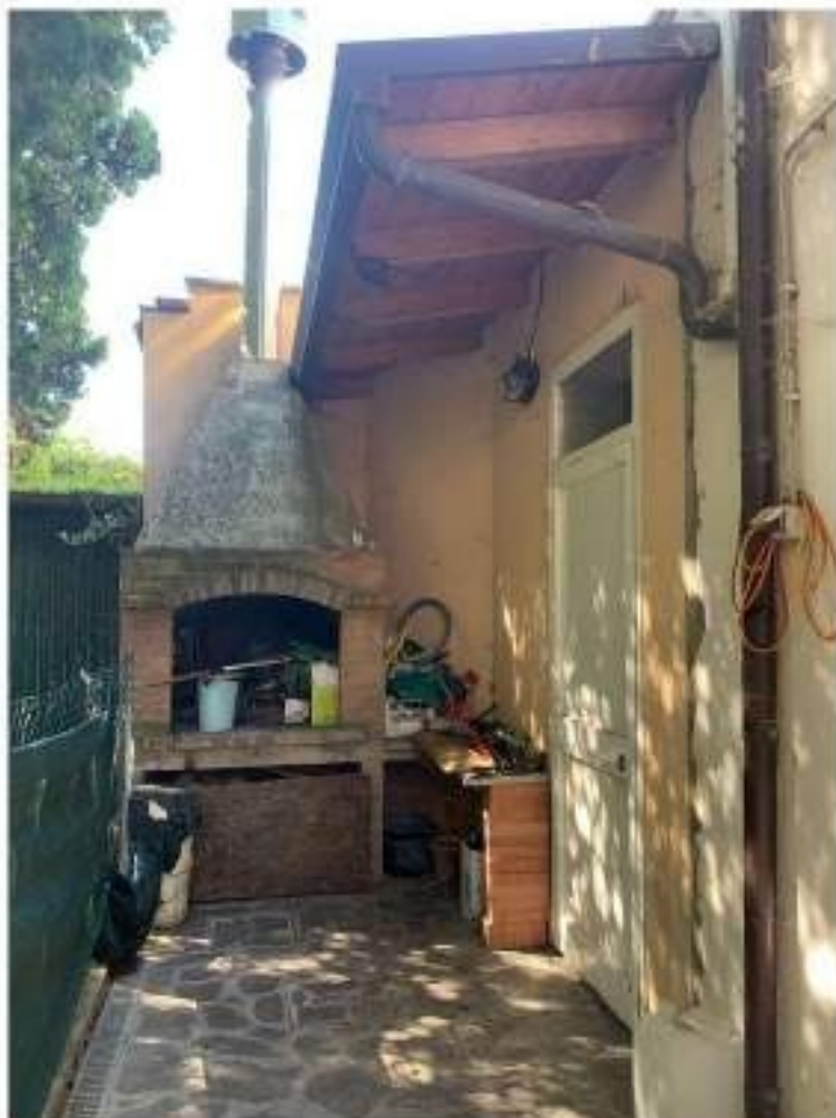
11 Accesso retro