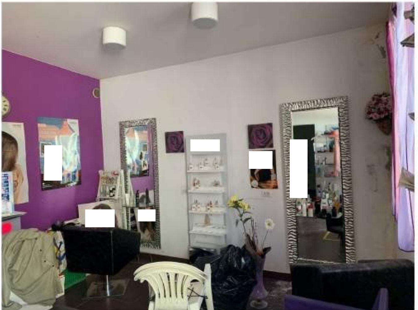
02 Locale 1