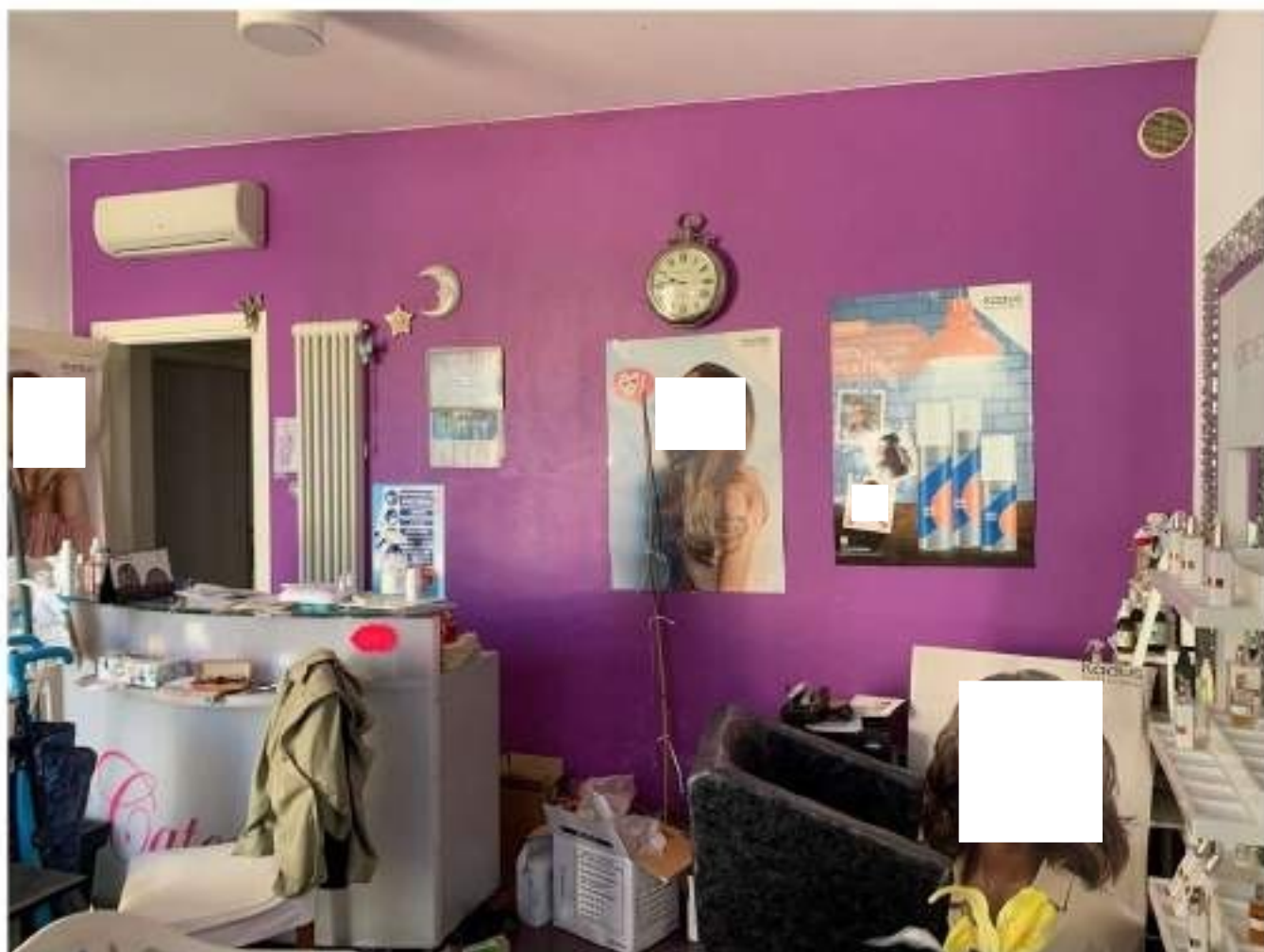
03 Locale 1