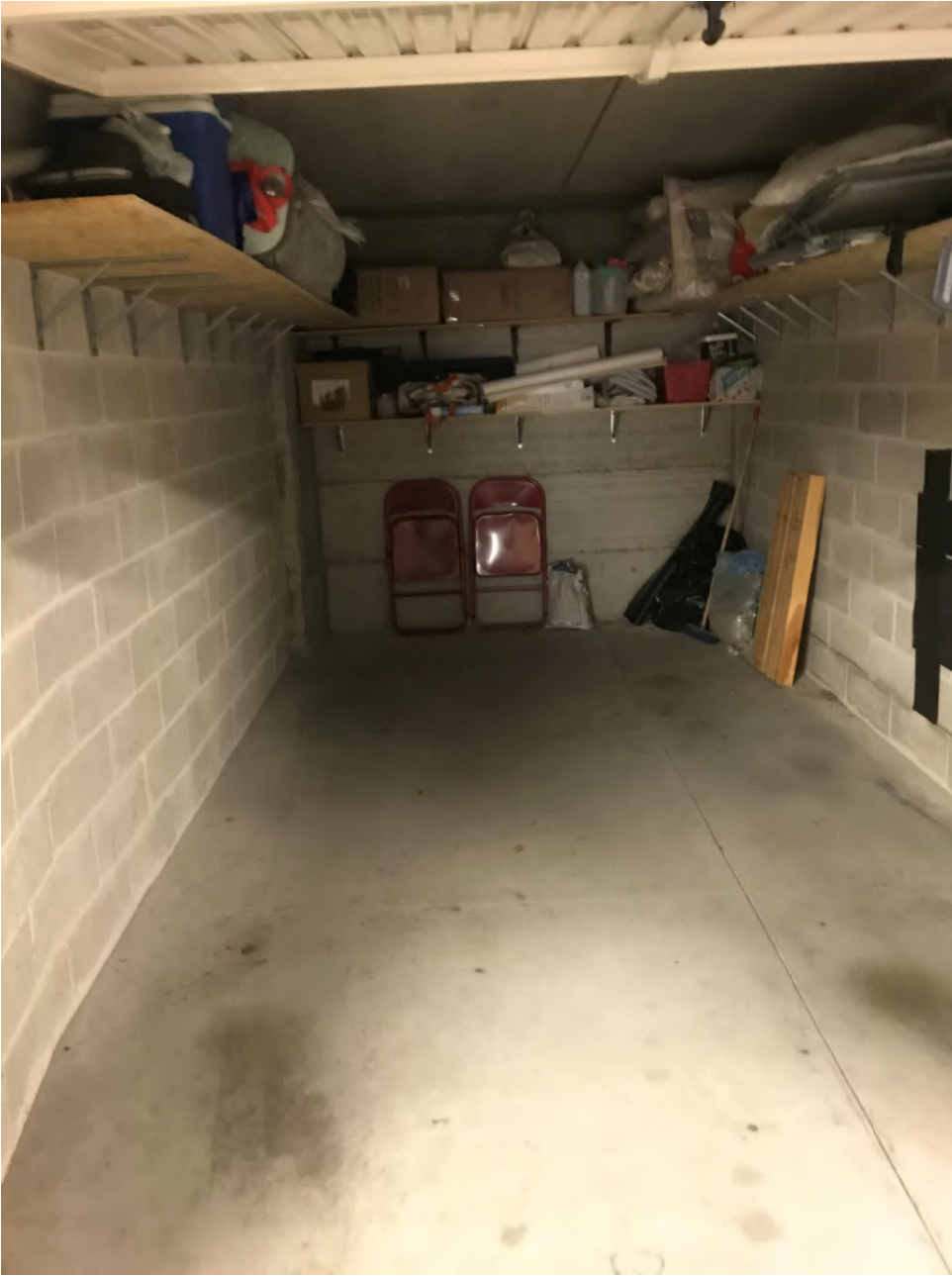
Garage sub 42